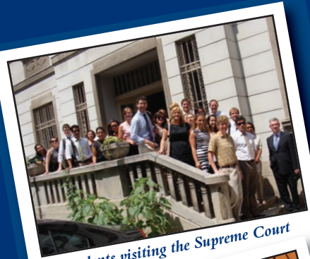
Students visiting the Supreme Court