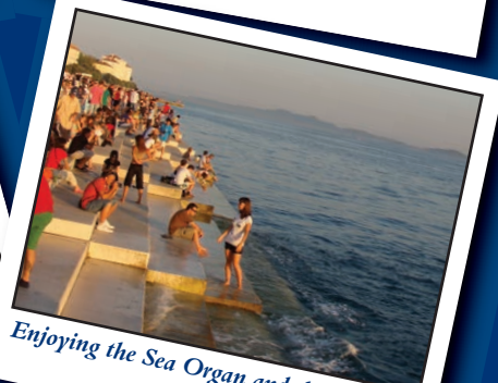
Enjoying the Sea Organ and the Adriatic