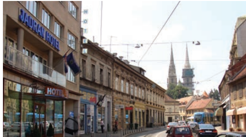
Program hotel in Zagreb (Jadran on left)

In Zagreb, students will be housed in a centrally located hotel – a convenient walk or trolley ride from the University of Zagreb where classes will be held. Breakfast will be provided at the hotel and lunch will be provided nearby. Students are on their own for dinner.