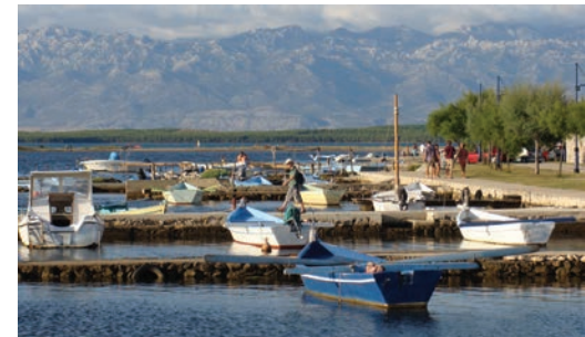
Nin and the coastal range in the background