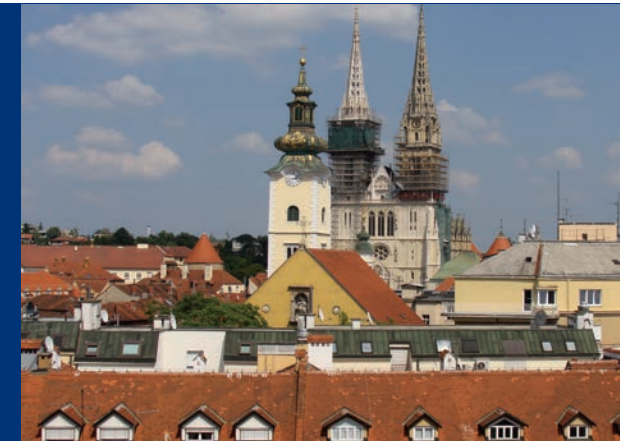
Cityscape of Zagreb, capital of Croatia

Participants will be chosen from law schools throughout North America, Europe and around the globe. The enrollment maximum is 36 students; it is anticipated that approximately half of the students will come from the United States and the other half from around the globe. In 2011 and 2012, the program attracted students from six continents. This program may be of particular interest and value to students preparing to participate in the Willem C. Vis International Commercial Arbitration Moot. The Institute will provide a uniquely international educational experience to students from multiple legal and educational backgrounds, as participants will be chosen from an internationally diverse group of law schools.