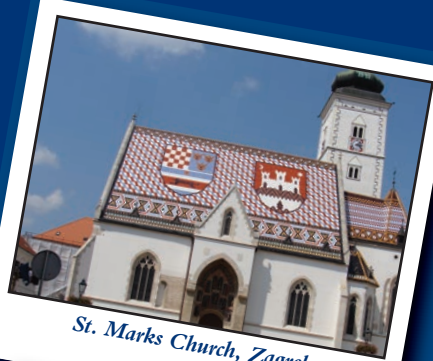
St. Marks Church, Zagreb