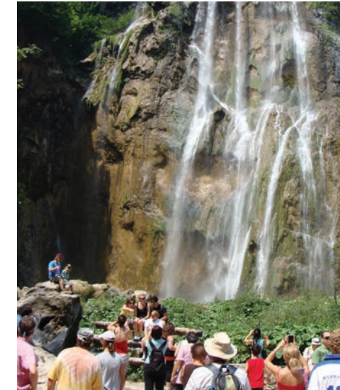
Waterfalls at Plitvice Lakes National Park

Please follow the Application Requirements listed on the previous page.