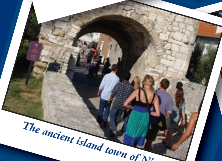
The ancient island town of Nin