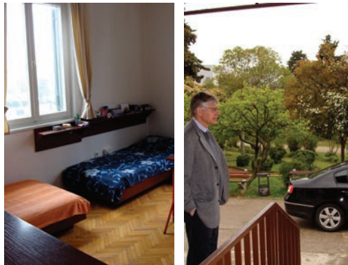
Zadar dorms inside and out

In Zadar, instructional facilities will be provided at the University of Zadar in a classroom setting right on the water, and breakfast and lunch will be available at the nearby student cafeteria. Students will be housed in dorms within reasonable walking distance of the cafeteria and classroom locale. All classroom and dormitory facilities will include Internet access (computer labs and wireless access for your personal computer).