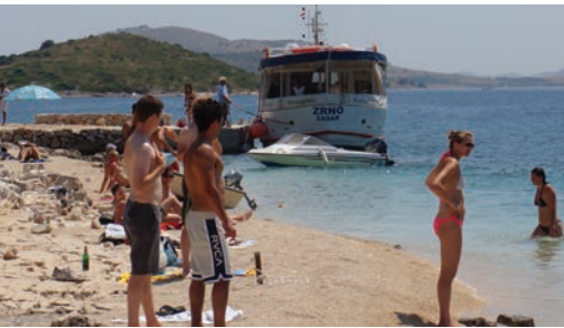
Our boat visits an island beach near Zadar

All instruction will be in English. The educational content of the program is one five-credit course that will cover: (1) an overview of the nature and structure of international business transactions; (2) an overview of mediation and arbitration as private means of resolving international commercial disputes; (3) a brief introduction to private international law and comparative contract law principles; (4) an in-depth study of the law governing international sales of goods, with a focus on the CISG; (5) an in-depth study of the law governing international commercial arbitration and enforcement of arbitration awards, with a focus on the UNCITRAL Model Law and the New York Convention; and (6) the development of analytical, research, oral advocacy, and written advocacy skills in the context of a dispute arising out of a practical problem based on a fictional international sales transaction.